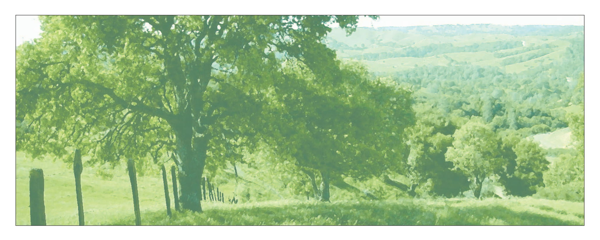
FINAL ENVIRONMENTAL IMPACT STATEMENT